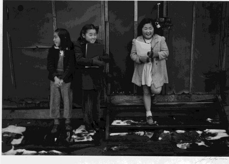
School children, Manzanar Relocation Center, California / photograph by Ansel Adams, 1943

https://www.loc.gov/resource/ppprs.00357/