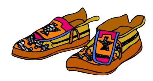
soft leather shoes or boots with no heel