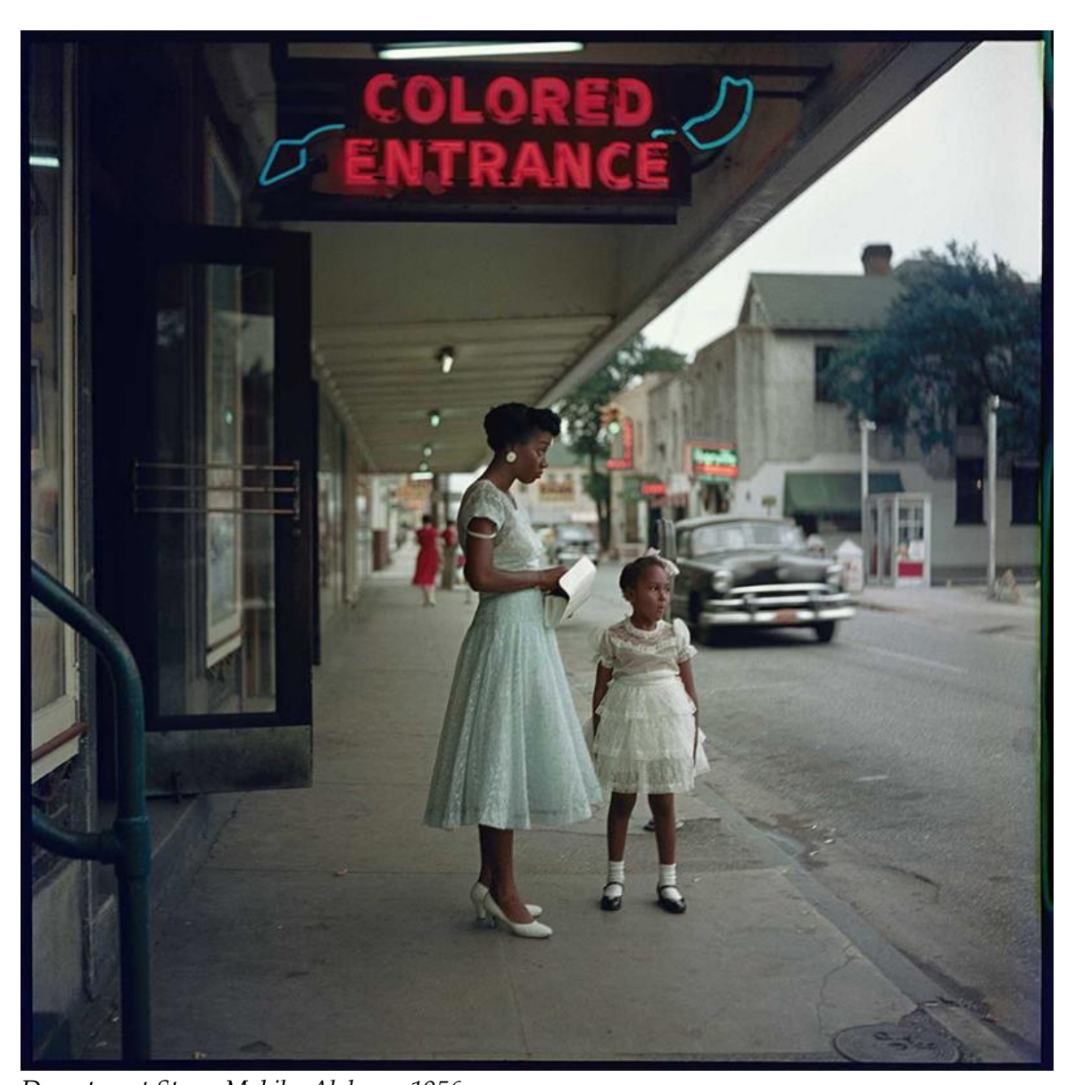
Department Store, Mobile, Alabama, 1956.